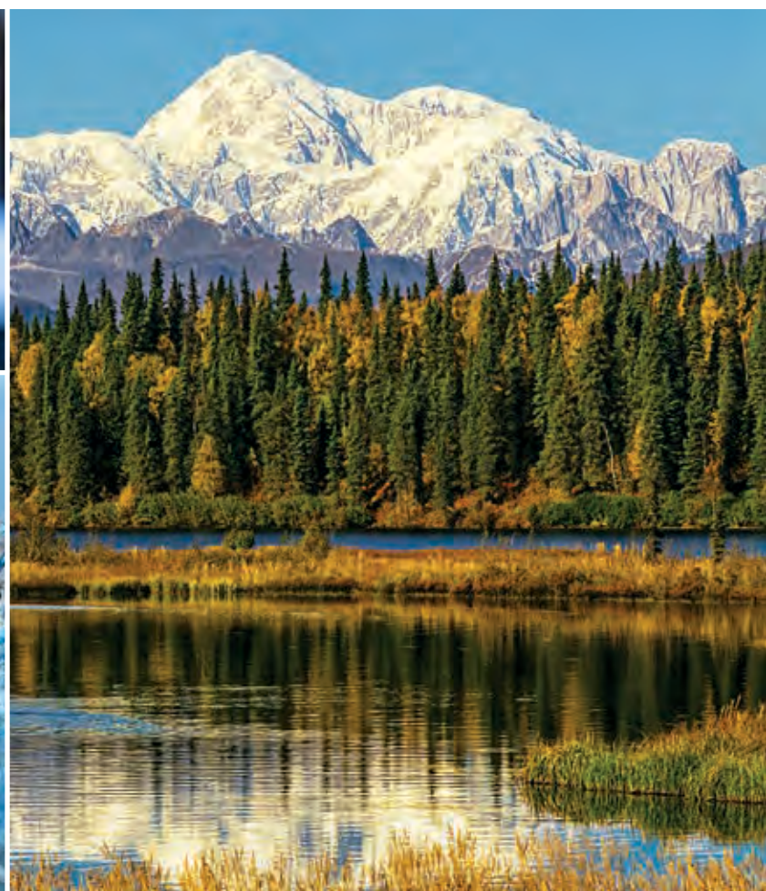
Denali National Park & Preserve, Alaska