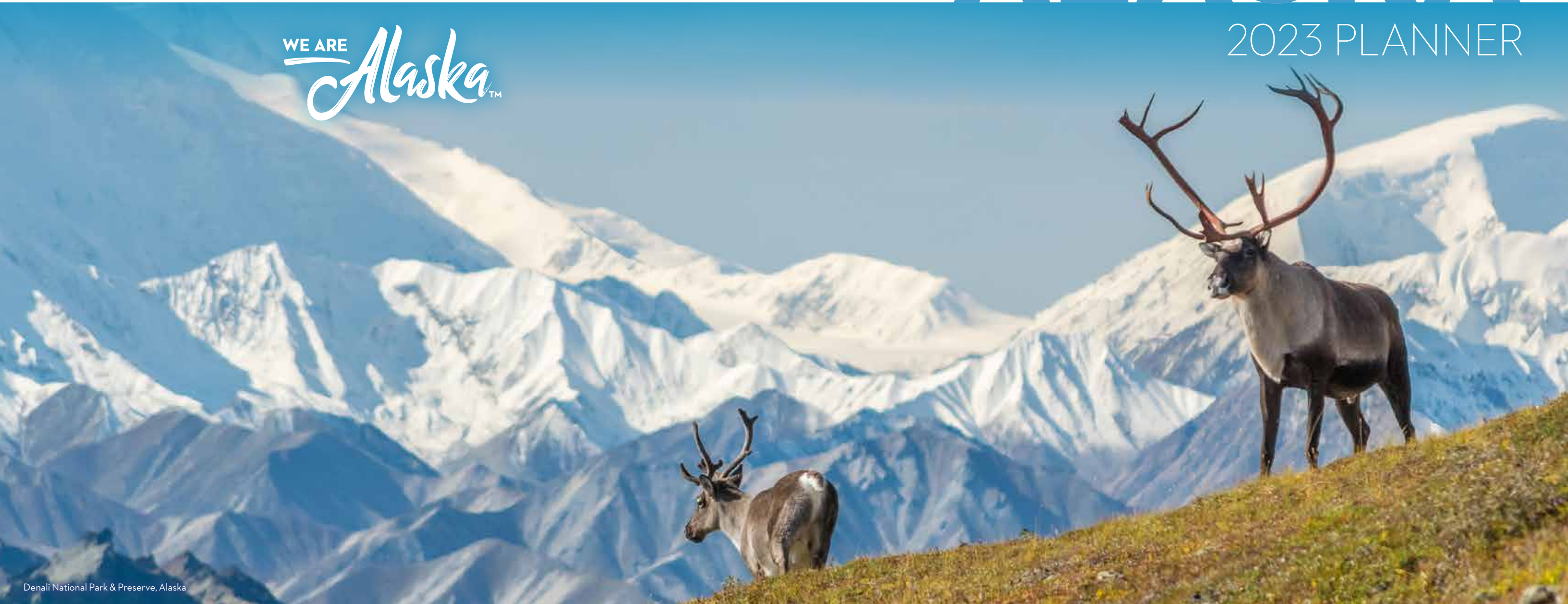
Denali National Park & Preserve, Alaska

CRUISES & CRUISETOURS APRIL-SEPTEMBER 2023