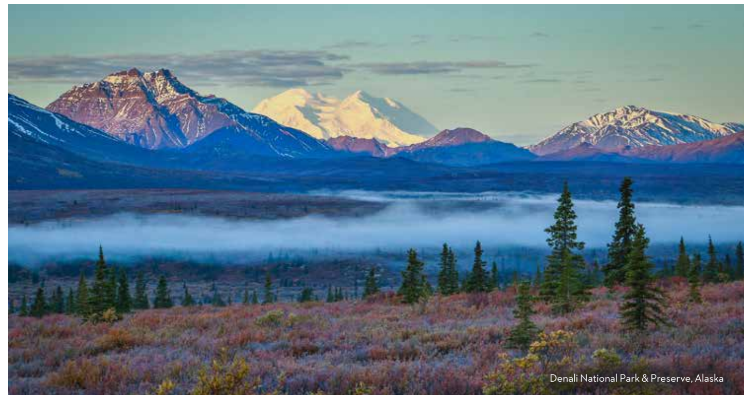
Denali National Park & Preserve, Alaska

A ride on board the McKinley Explorer® luxury domed railcars for a breathtaking journey between Anchorage and Denali