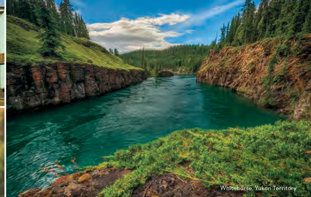
Whitehorse, Yukon Territory