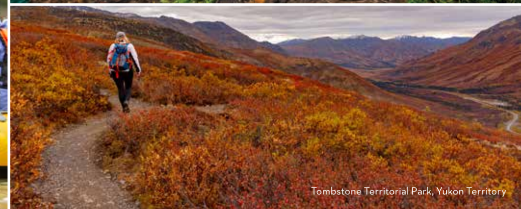
Tombstone Territorial Park, Yukon Territory

ON BOARD AND ASHORE , OUR PEOPLE ARE ALASKA AND YUKON EXPERTS AND ENTHUSIASTS, EAGER TO SHARE THE LAND THEY LOVE WITH YOU.