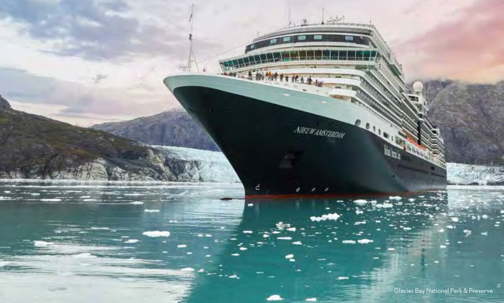
Glacier Bay National Park & Preserve