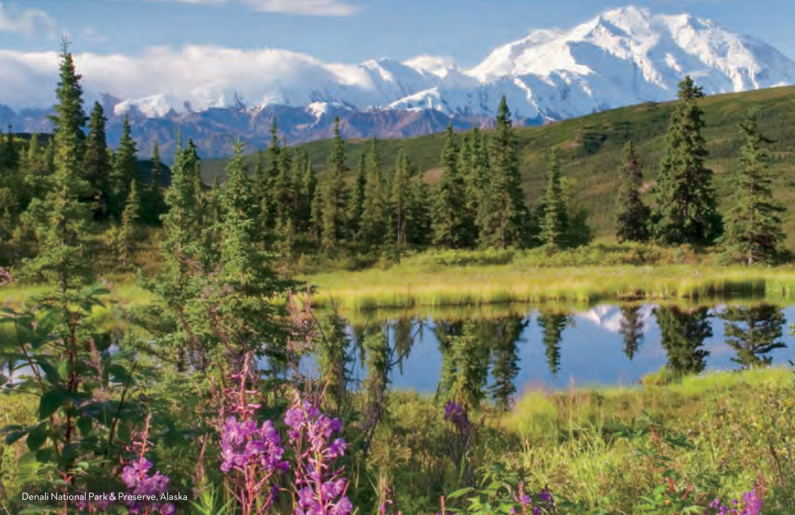
Denali National Park & Preserve, Alaska