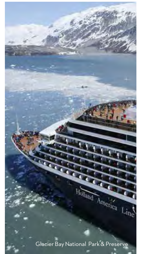
Glacier Bay National Park & Preserve

For the most up-to-date details and fares see hollandamerica.com .