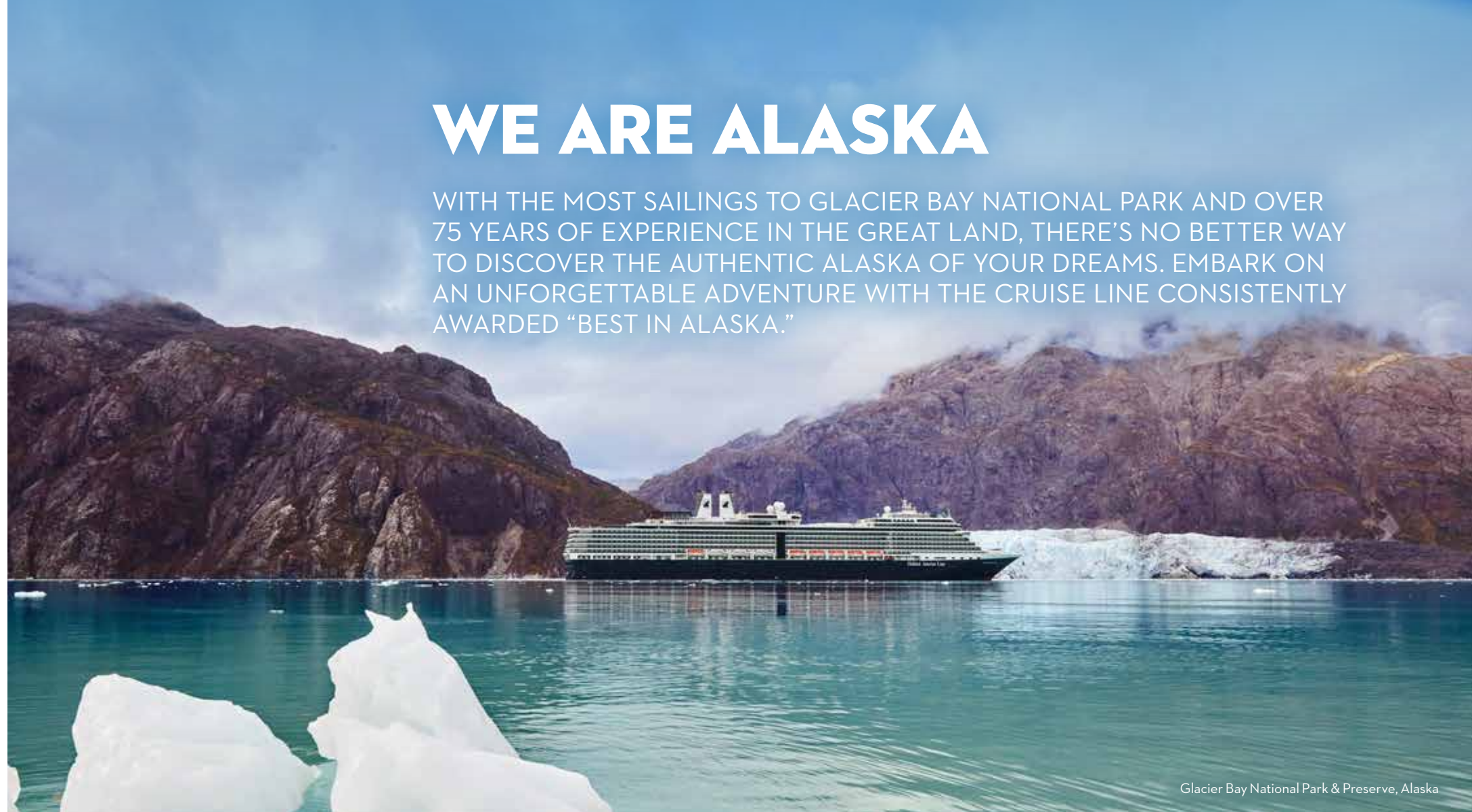
Glacier Bay National Park & Preserve, Alaska

WITH THE MOST SAILINGS TO GLACIER BAY NATIONAL PARK AND OVER 75 YEARS OF EXPERIENCE IN THE GREAT LAND, THERE'S NO BETTER WAY TO DISCOVER THE AUTHENTIC ALASKA OF YOUR DREAMS. EMBARK ON AN UNFORGETTABLE ADVENTURE WITH THE CRUISE LINE CONSISTENTLY AWARDED "BEST IN ALASKA."