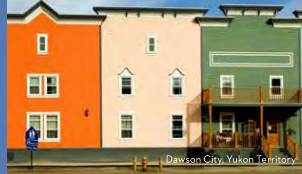
Dawson City, Yukon Territory