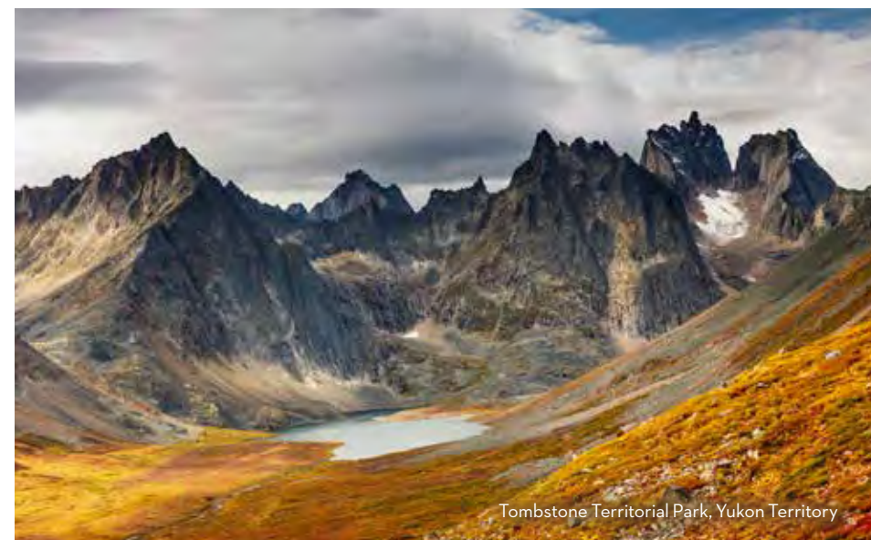
Tombstone Territorial Park, Yukon Territory

Glide along the Yukon River past tall pines, historic towns, moose and more on the Klondike Spirit paddlewheeler.