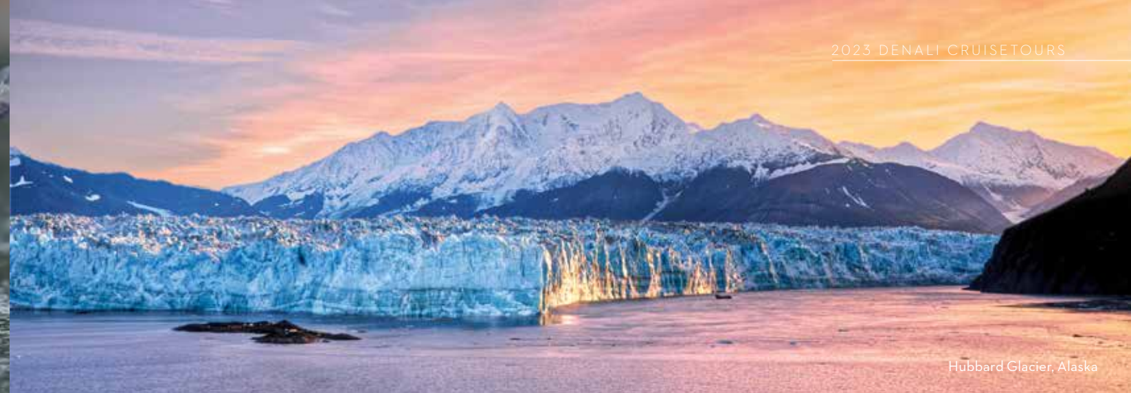
Hubbard Glacier, Alaska