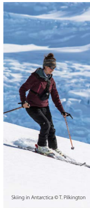
Skiing in Antarctica