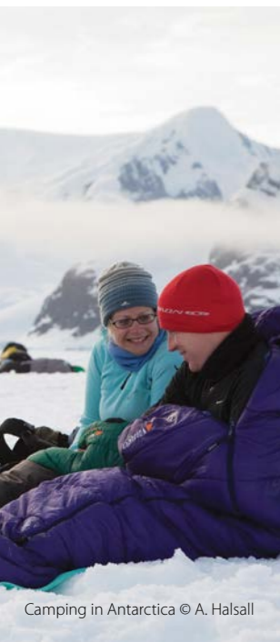
Camping in Antarctica

Our cabins and suites are beautifully appointed, with simple, neutral colours taking inspiration from nature. Choose from a range of configurations and features, including twin and double-bed options, private balconies, and interconnecting staterooms.