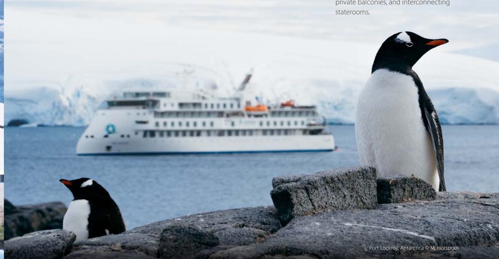
Port Lockroy, Antarctica