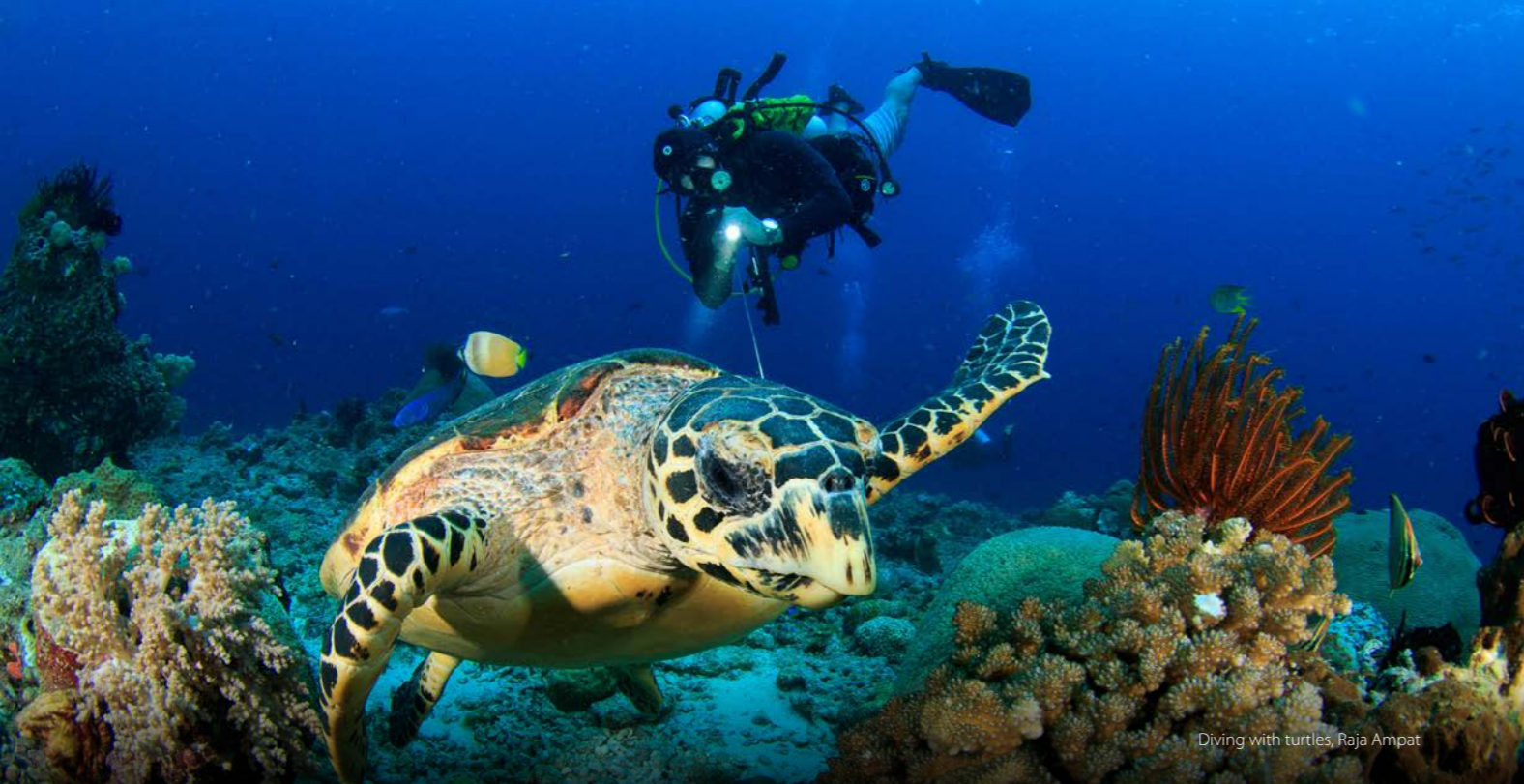
Diving with turtles, Raja Ampat