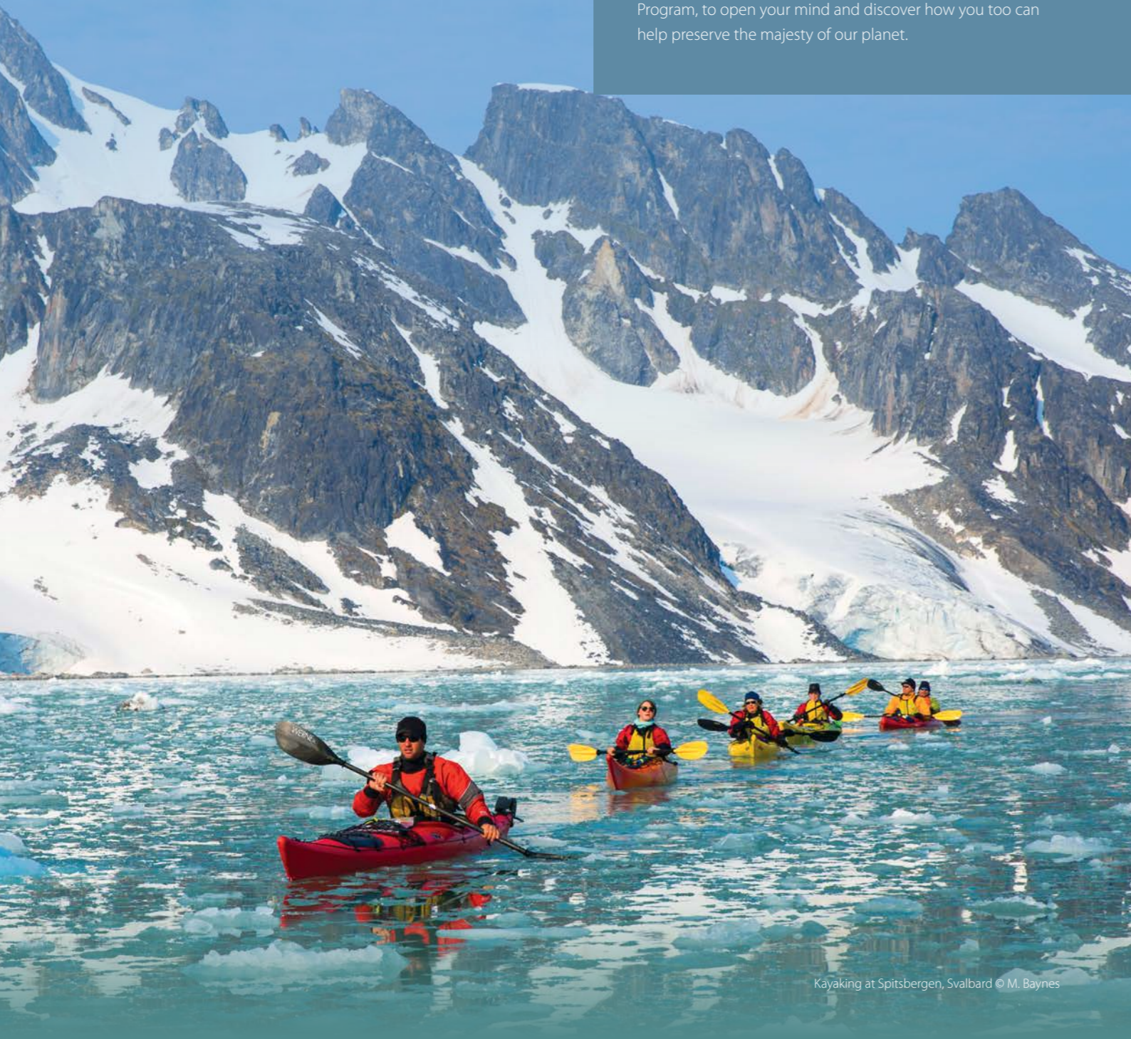
Kayaking at Spitsbergen, Svalbard