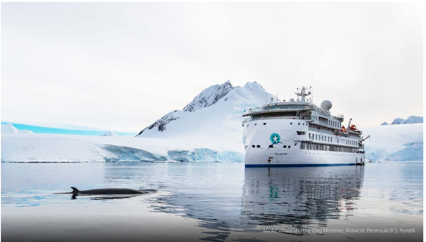
Minke whale and the Greg Mortimer, Antarctic Peninsula

"A wonder-filled experience of a lifetime. Words can't describe it to others, and photos only go so far, but it will stay in my mind forever."