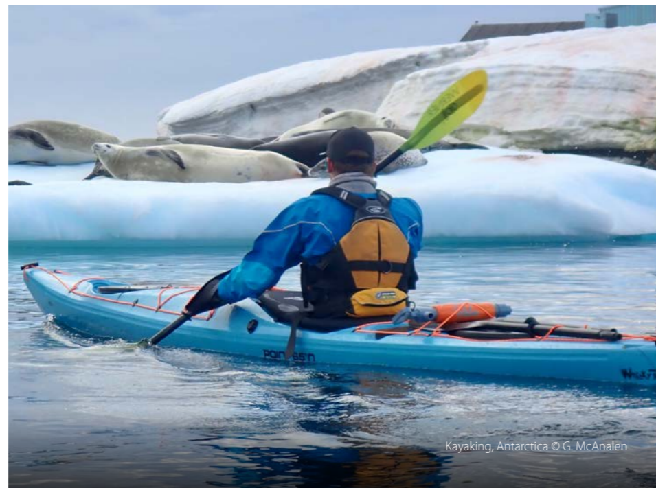
Kayaking, Antarctica