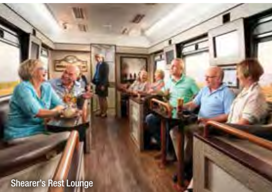
Shearer's Rest Lounge