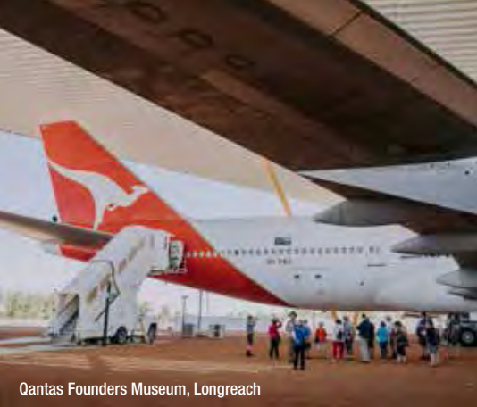
Qantas Founders Museum, Longreach