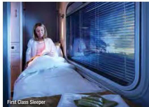
First Class Sleeper