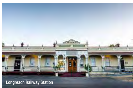
Longreach Railway Station