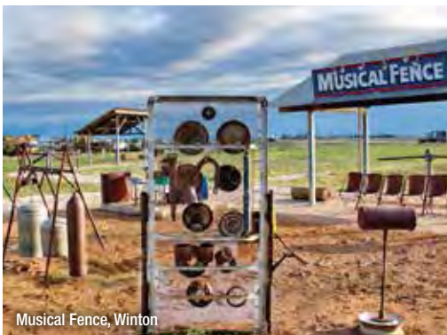
Musical Fence, Winton