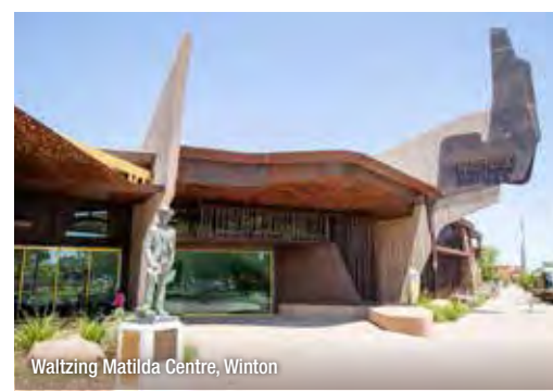
Waltzing Matilda Centre, Winton