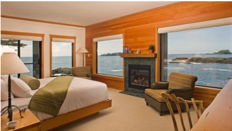
Wickaninnish Inn sits on a wild corner of

Chinzombo might be Africa's most sophisticated safari experience. Spread over 60 acres on the banks of the Luangwa River, it offers six impeccably styled canvas-walled villas with freestanding tubs, private pools and outdoor lounge areas from where you can watch hippos lumber by. But their outstanding guides, who can track down the most elusive wildlife, including wild dogs and leopards, are the real clincher.