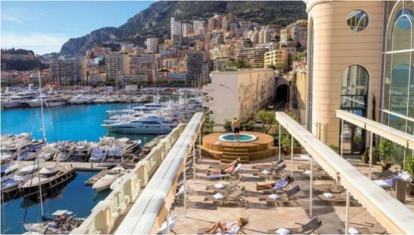
Hotel de Paris, Monaco

Have you noticed? A hotel is no longer content to be just a place to lay your hat. Whether a basic business property or a ritzy five star, it seems most hotels now promise to be the experience, rather than just a necessary adjunct to an overall travel experience. They promise to be "authentic", "bespoke", "local", "curated" and all manner of other buzz-word-type things designed to push our emotional buttons as they clamour for the lucrative millennial traveller dollar.