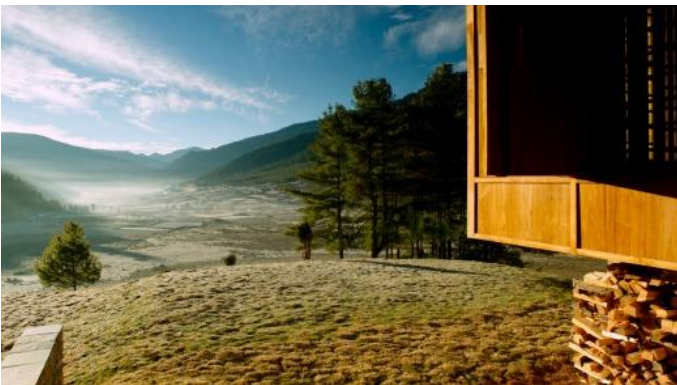
Hotel Amankora, Bhutan.

That's why, with this list from Traveller's most hospitality-savvy writers, we celebrate the hotel that moves us. It could be a luxury place of uninterrupted tradition; a property where history has happened; a small inn that has real meaning to a local community or a sparkling modern edifice of outstanding architecture.