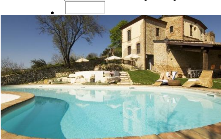
Hotel Antico Borgo, Italy.

Lost the Christmas spirit? Get thee here, stat. This opulent 1888 Scottish baronial castle-style sprawling hotel high in the Canadian Rockies takes Christmas next level, starting on your arrival in the cavernous lobby with an enormous sparkly tree and carol singers. Once you've had a sleigh ride in the