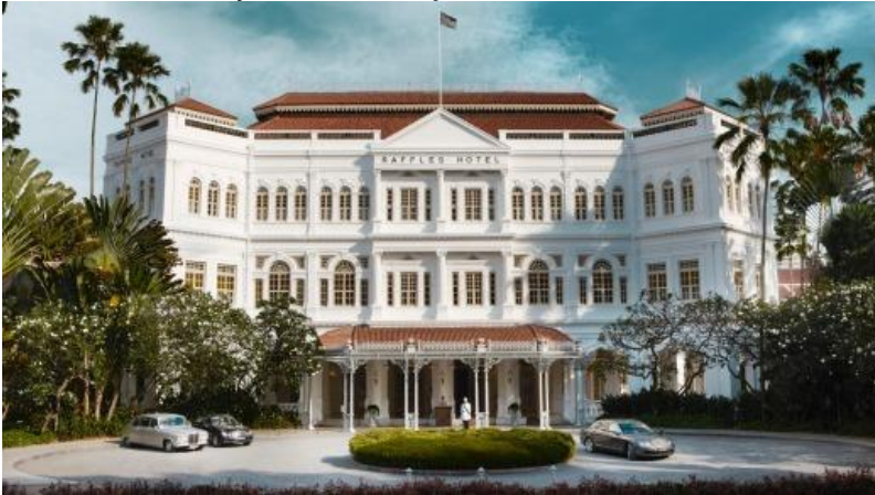
Raffles Hotel, Singapore.

Where else in the world can you sleep in a floating palace? From the opulent suites and the pool pavilion with its mirror-mosaic walls, to the floating Jiva Spa boat moored off the jetty and nightly performances by Rajasthani musicians and dancers in the courtyard, the Palace is the perfect spot in which to stoke your maharaja fantasies.