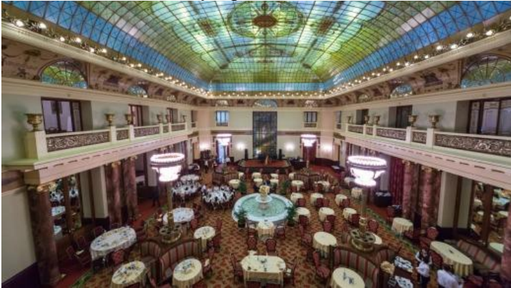
Hotel Metropol, Moscow.

A hotel inspires when it feels very much part of its surrounding culture. Cheong Fatt Tze Mansion is an impressive, blue-painted Chinese-style courtyard mansion, once the home of a prominent 19th-century tycoon. Guests can delve into the building's history, architecture and former occupants through daily in-house tours, and staying here contributes to the conservation of this fabulous building. S