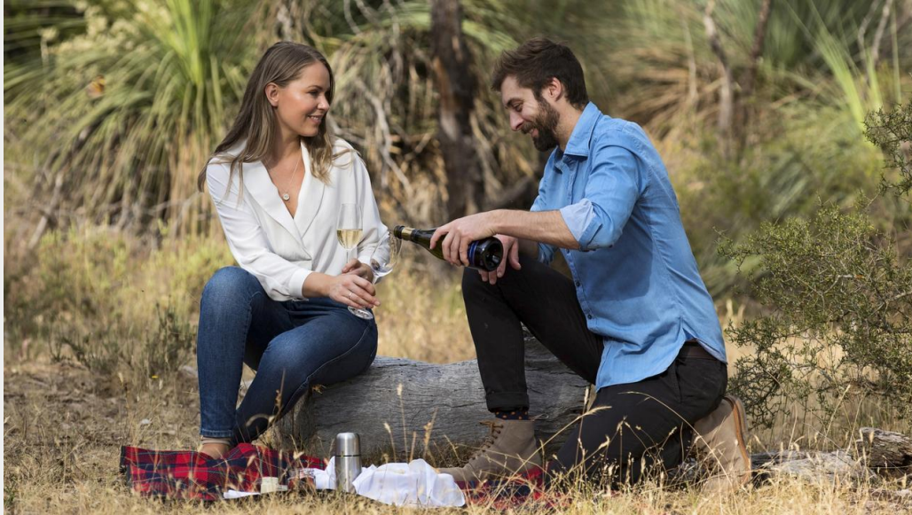
A couple enjoys a Breakfast with Kangaroos experience in Barossa Valley.