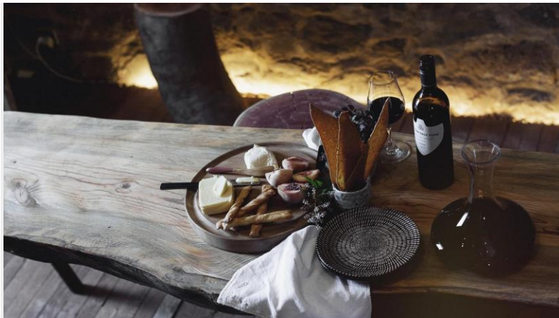
Nibbles inside Hutton Vale Farm's JHA accommodation.

This is a farm-stay but not as you know it. The renovation of the old stone building on Hutton Vale Farm's beautiful Barossa property is as luxurious as it gets. Enhance your stay with a 'cook-your-own' paddock to plate meal (using produce grown on the farm – ethically grown lamb, free range eggs and premium wine). Or, with a week's notice, Jan can organise an in-house chef to whip up a three-course meal – served to you in the accommodation. The property is a one-hour drive from Adelaide, or take a charter flight which lands on the farm's private airfield between the Mt Edelstone and the Hutton Vale Farm Shiraz vineyards. The outdoor showers are a romantic touch, too.