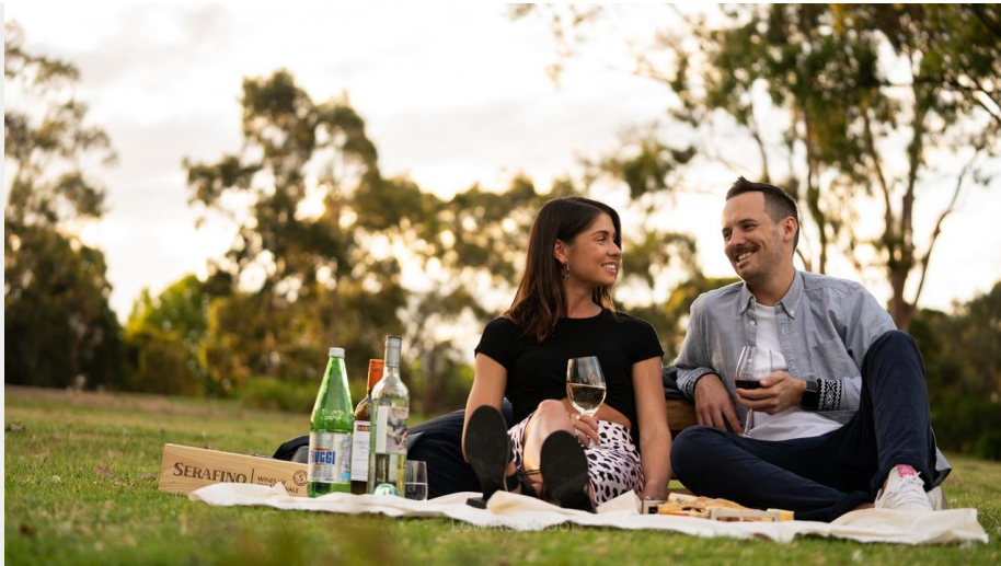
A couple picnics at the Serafino Restaurant site in McLaren Vale.

This daylong experience begins with an hour-long scenic helicopter tour, starting at Serafino cellar door in McLaren Vale, and over Lake Alexandrina, Goolwa Beach and Victor Harbor. Cosy up for a picnic lunch, then, back at Serafino, enjoy dinner with paired wines inside the restaurant. Stay the night in their spa suite (inquire about candles and rose petals if you really want to step things up a notch) and enjoy breakfast in bed the next day. From $1450 including transfers from Adelaide,