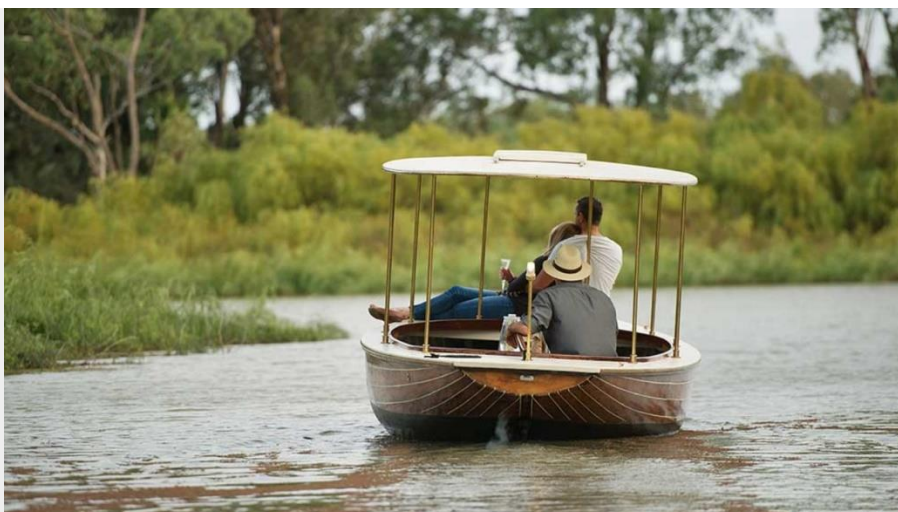
The Frames' gondola cruise on River Murray.

Location, location, location. Third generation citrus and wine grape growers, Rick and Cathy Edmonds run The Frames Luxury Accommodation and have won many- an award for their three private villas, built on a clifftop overlooking the mighty Murray River. You could spend your getaway holed up in your gorgeous hideaway – it has all the trimmings (including gourmet breakfast provisions, a supreme barbecue pack and a three-course meal prepared by the in-house chef) but to really stoke the loving vibes, a two-night all-inclusive stay includes the Sunset Gondola River Cruise with sparkling wine and a cheese platter. You'll be in the mood in no time. $250pp for the cruise alone; From $1000pp all-inclusive accommodation