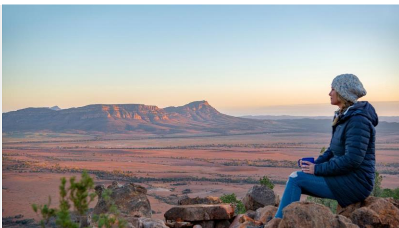
Sunset on Chace at Rawnsley Park.