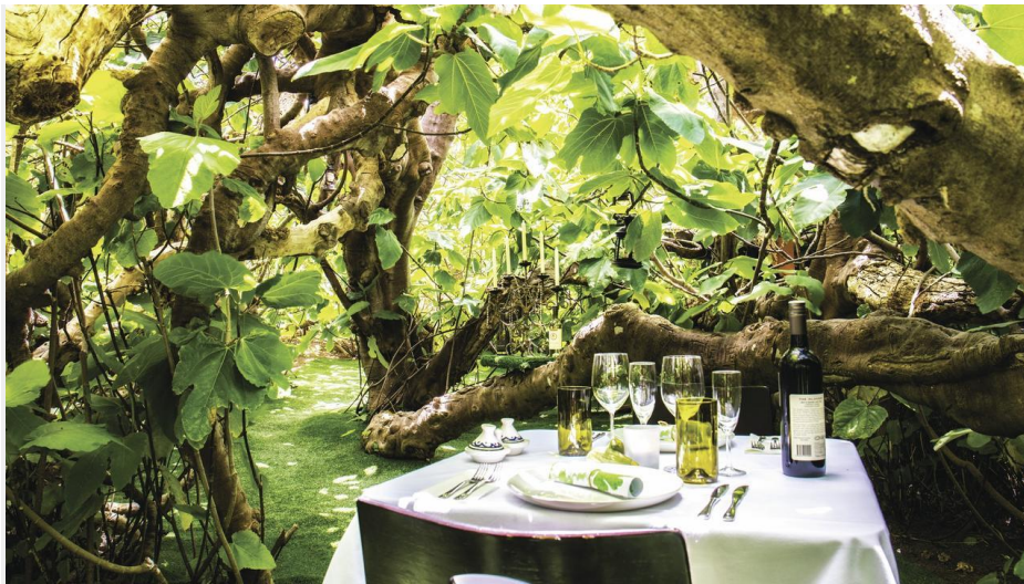
Kangaroo Island’s Enchanted Fig Tree.

While travel restrictions apply, a flight or ferry to Kangaroo Island is the closest we can get to an “overseas” holiday for a while. So, make the most of it. Discover a dining experience like no other under the gnarled branches and lush green leaves of a 120-year-old, colossal fig tree. On Friday and Saturday nights for the rest of February, the Enchanted Fig Tree will turn into a twinkling wonderland with bud lights and candlelight, setting a romantic scene for the night’s degustation menu.