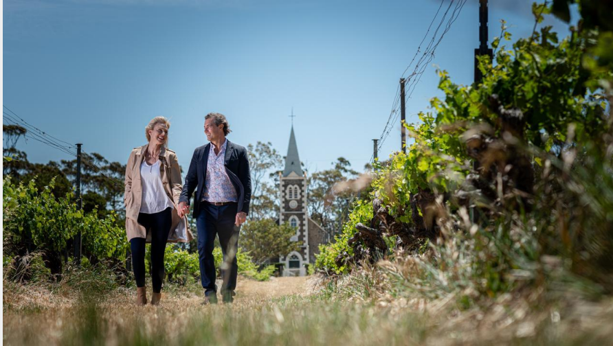
A couple walks through Henschke vineyards as part of its Ultimate Authentic Barossa Experience.